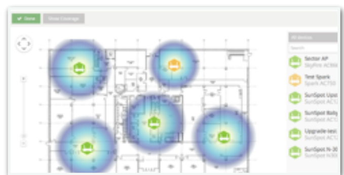
Floor Map Management