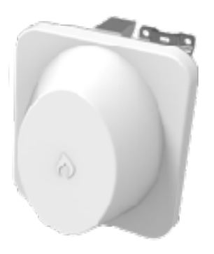
19cm Size w/ 60GHz + 5GHz