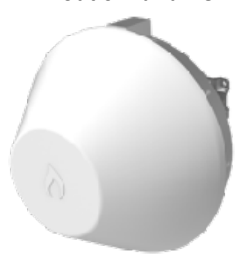
35cm Size w/ 60GHz + 5GHz